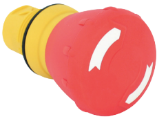
E-Stop twist to release

For a system such as Figure 1, use the single function safety relay 440RS12R2.