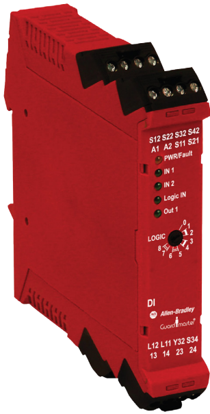
Single function safety relay